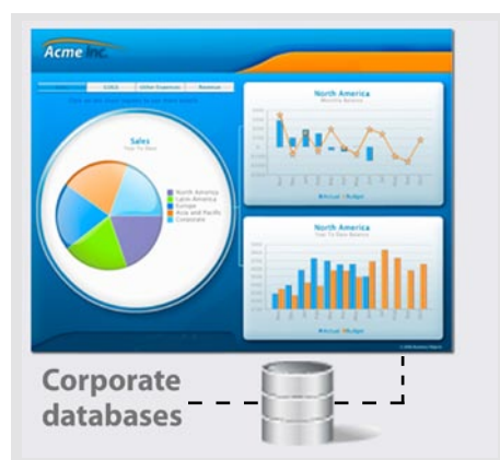
Figure 1: Sample Visual Model of Corporate Data

Best of all, SAP Crystal Dashboard Design, personal edition, updates models in real time. So you can be confident